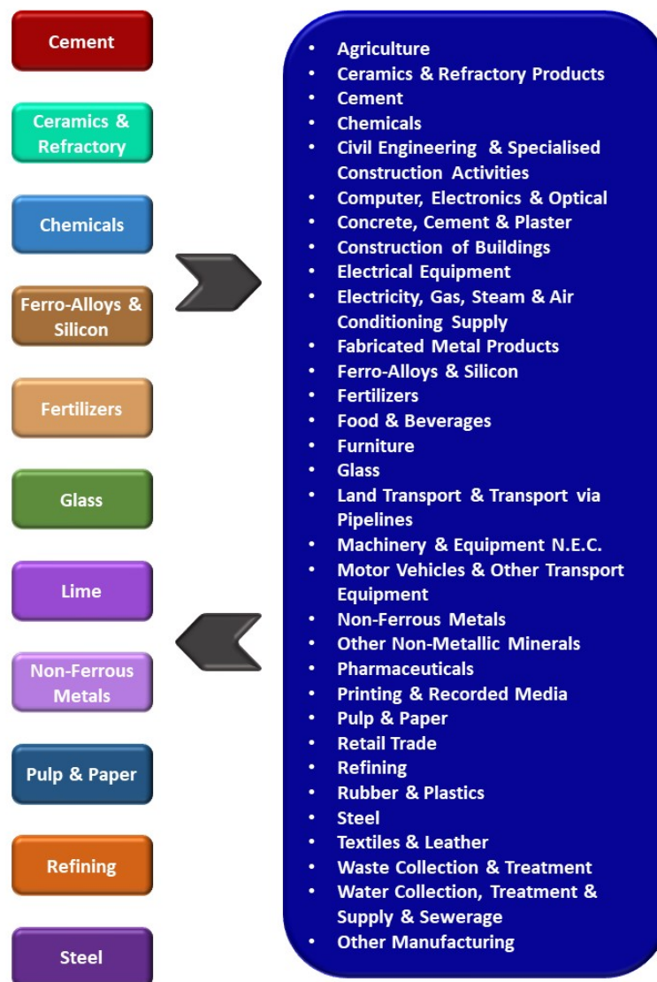
Figure: Value chain links of energy-intensive industries to other sectors in the economy and other energy-intensive industries. Industrial Value Chain: a Bridge Towards a Carbon Neutral Europe-Europe's Energy Intensive Industries contribution to the EU Strategy for long-term EU greenhouse gas emissions reductions, 2018.

The High-level Group on EIIs of the European Commission set up the Masterplan for a competitive transformation of EU energy-intensive industries enabling a climate-neutral, circular economy by 2050 . This report contains the scheme below, which describes the main sectors of Energy-Intensive Industries and their links to other sectors: